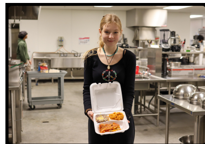
Culinary Arts & Management