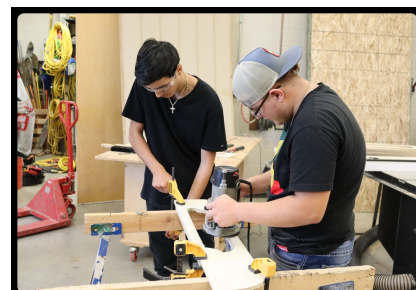
Construction & Design (Building Trades)