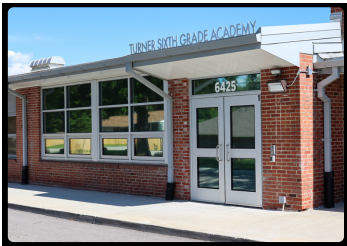
TURNER SIXTH GRADE ACADEMY