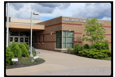
OAK GROVE ELEMENTARY