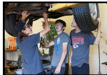
Mobile Equipment Maintenance (Auto Tech)