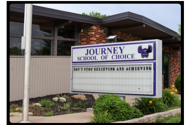
JOURNEY SCHOOL OF CHOICE