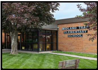
MIDLAND TRAIL ELEMENTARY